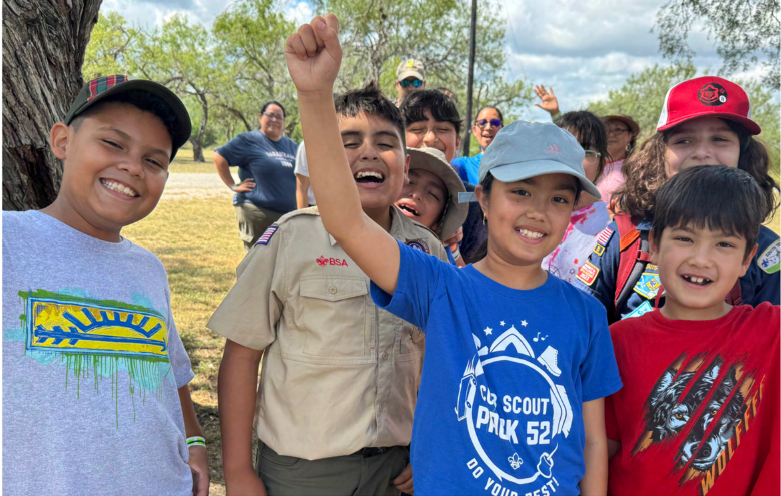
CUB FAMILY CAMPOUT - CAMP KARANKAWA, NOVEMBER 2024