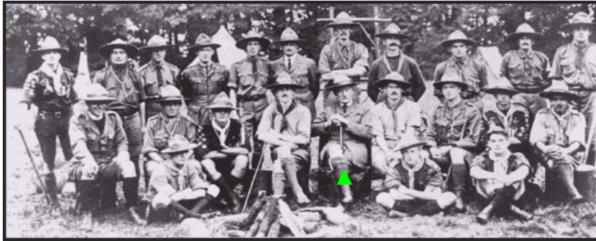
September, 1919- Baden-Powell is seated center in the front row at green arrow

On the morning of September 8, 1919, nineteen men dressed in short pants and knee socks, their shirt sleeves rolled up, assembled by patrols for the first Scoutmasters' training camp held at Gilwell Park in Epping Forest, outside London, England. The camp was designed and guided by Sir Robert Baden-Powell, a 61 year-old retired general of the British Army and the founder of the World Scouting Movement.