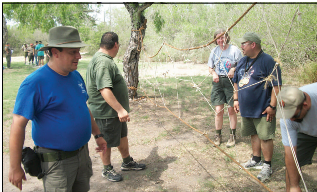
Working together we can do it!