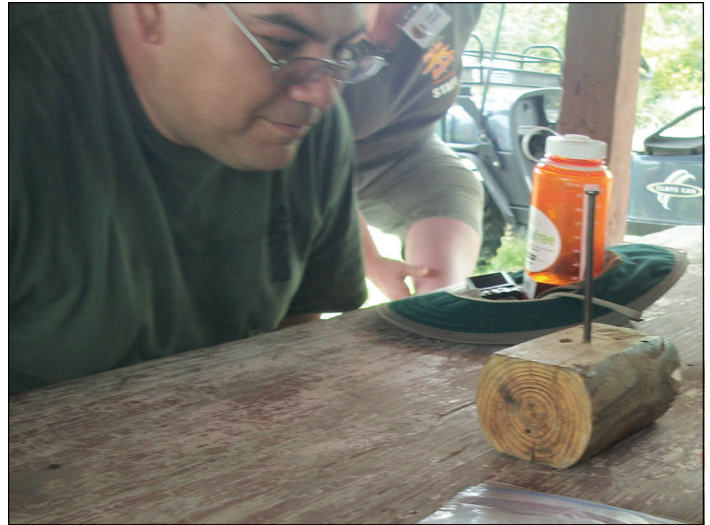
What were the instructions again!