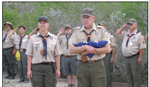
Respect for our flag