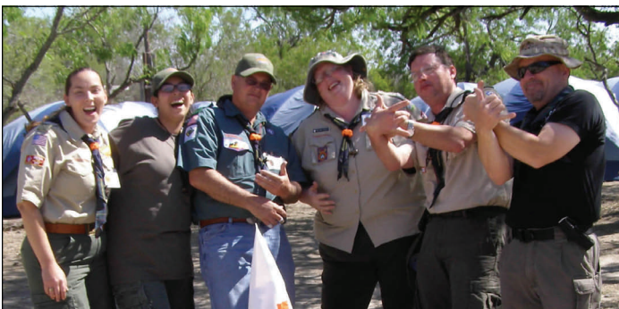
Wood Badge staff having too much fun!