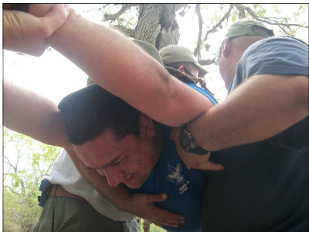
Wood Badgers make great teams!

(Copy of notes dictated by B-P in 1925 authenticating the story of Chief Dinizulu's necklace. Original notes in The Scout Association's Archives, typed on Baden-Powell's head notepaper and addressed Pax Hill, Bentley, Hampshire.)