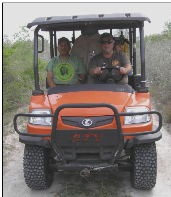
Quartermasters are awesome!

(Taken from http://www.scoutbase.org.uk/library/hqdocs/facts/pdfs/fs145001.pdf )