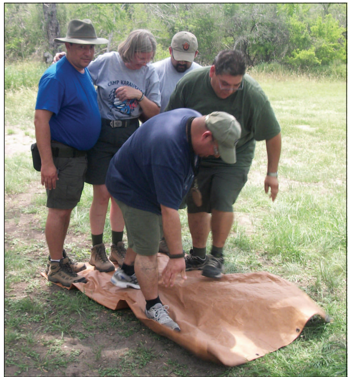
Living on an island brings us together!