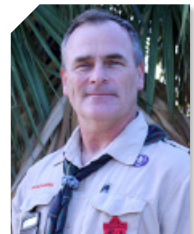
Jeff Chilcoat Scribe & Photographer