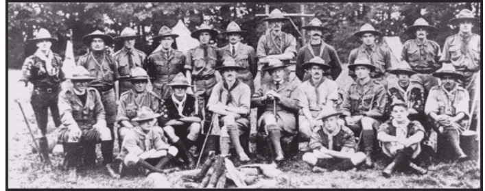
September, 1919- Baden-Powell is seated center in the front row at green arrow

On the morning of September 8, 1919, nineteen men dressed in short pants and knee socks, their shirt sleeves rolled up, assembled by patrols for the first Scoutmasters' training camp held at Gilwell Park in Epping Forest, outside London, England. The camp was designed and guided by Sir Robert Baden-Powell, a 61 year-old retired general of the British Army and the founder of the World Scouting Movement.